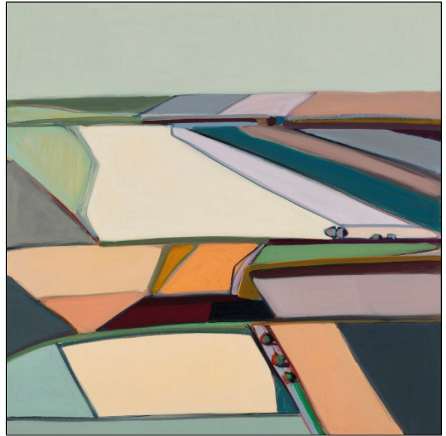
Kansas Prairie Fields