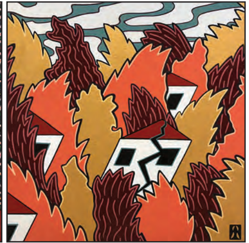
Whisper On the Wind , 1978, acrylic on canvas, 18 x 18 inches, Private Collection

teaching" but at that time when MFA programs were pushing out an average of thirty to forty graduates a year, only a dozen or so teaching positions would open up around the country. Jilg believes his friend would have been a good teacher but there were "just too many of us!" 5