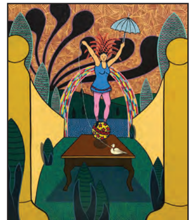
Spring-time Dancer on a Red-Sky Morning , 1973, acrylic on canvas, 18 x 15, Private Collection