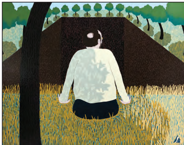
On the Edge , 1988, acrylic on canvas, 24 x 30 inches, Private Collection