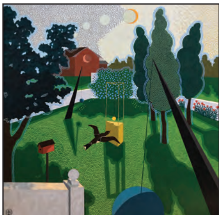
The Day the Moon Stole the Sun , 1995, acrylic on canvas, 42 x 42 inches, Collection of Margarete Dorsch