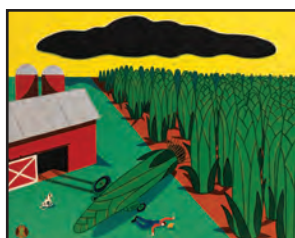
Death in the GMO Corn Patch , 2006, acrylic on canvas, 16 x 20 inches, Courtesy of Bartlett Arboretum