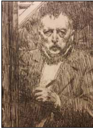
Självporträtt [Self-portrait] by Anders Zorn, 1911, etching, 6 1/4 x 4 3/4 in., Greenough Collection: Birger Sandzén Memorial Gallery