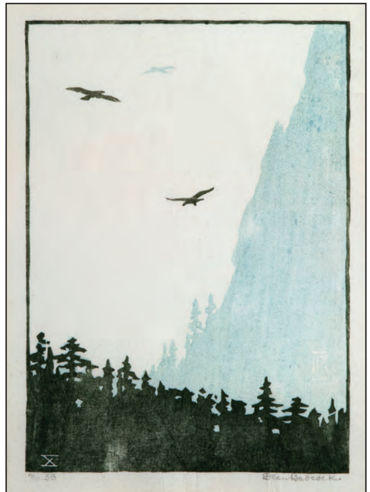
X, Color woodcut on paper; edition No. 58, 6 7/8 x 4 7/8 inches. Collection Kirkland Museum of Fine & Decorative Art, Denver, CO

In this exhibition are multiple impressions of several of Babcock’s woodblock prints. The Wilson Family has loaned the color woodcut Estes Cone in Winter accompanied by two unsigned proofs printed from the same carved blocks of wood. Each impression is unique, with varying intensities of color and shading. There are two impressions of untitled Roman numeral X, of flying birds near a cliff face, which show Babcock experimented with his designs—in this case making one cliff blue and in the other print, purple. Many of the prints in this exhibition carry Roman numeral designations that appear to begin with Estes Cone in Winter as the first in this chronological system. Most also carry an edition number, which indicates the order of printing. For this impression of Estes Cone in Winter , “No. 2” was the second print in the edition completed by