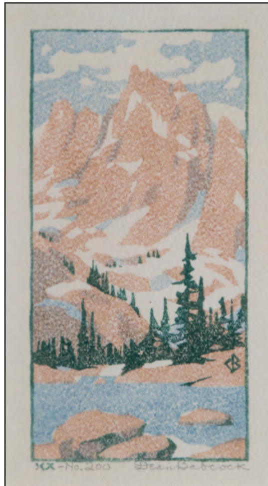
XX [view of Mt. Russell], color woodcut on paper; edition No. 200, 4 x 2 inches. Collection Kirkland Museum of Fine & Decorative Art, Denver, CO

the first printmakers who had immediately affiliated and showed with the society as soon as it was open to non-Californian artists. 10 1916 brought more opportunities to exhibit prints. In February, New Mexico printmaker Gustave Baumann (1881-1971) organized a print exhibition at the AIC, "American Block Prints and Wood Engravings," including his own work among a selection of other American printmakers such as Helen Hyde and Dean Babcock, who submitted eight prints. His Estes Cone in Winter , The Japanese Tree , and Medieval Mountain were among them. In May, a New York Times review mentioned Babcock's prints on display the Madison Avenue gallery Berlin Photographic Company. The review approved of wood engraving and block printing's gaining popular favor, and oftentimes being influenced by the art of