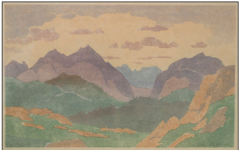
XXVI [aka Summer Clouds], color woodcut on paper; No. 28, 6 x 9 inches. The Wilson Family Collection