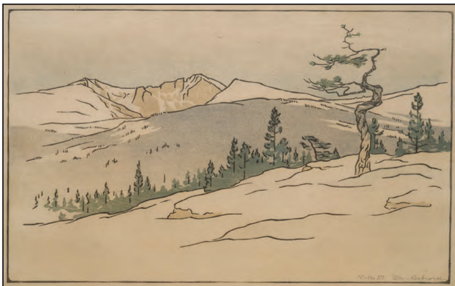
The Japanese Tree, V [aka Long's Peak], 1916, color woodcut on paper, 7 x 10 inches.