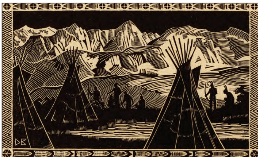
Timberline Camp , ca. 1935, woodcut on paper, 3 x 5 inches, Collection of the Fred Jones Jr. Museum of Art, University of Oklahoma