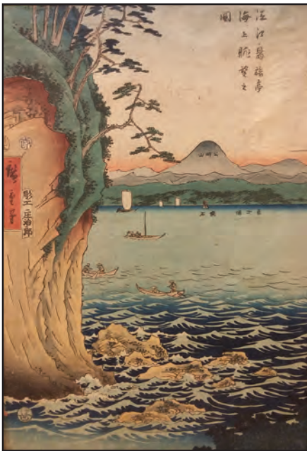
Picture of the Distant View of the Sea from the Inn at Enoshima [Enoshima ryotei yori kaijō chōbō no zu], Left panel of triptych by Utagawa Hiroshige and Utagawa Kunisada: Elegant Pastiche of Genji [Fūryū mitate Genji], 1854, 12 th month, color woodcut on paper; 13 ¼ x 9 ¼ in. Greenough Collection, Birger Sandzén Memorial Gallery