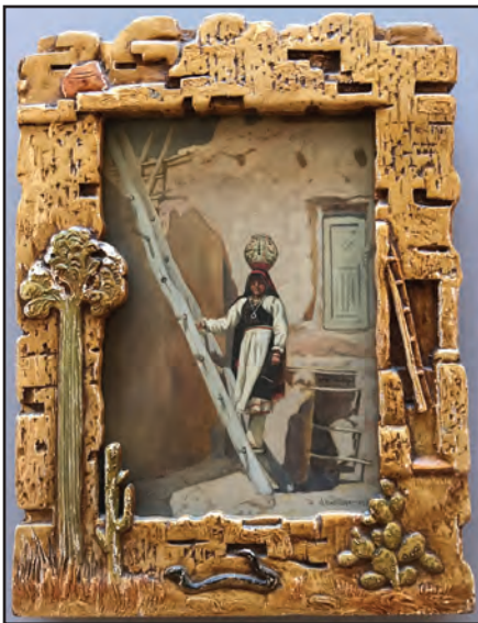
Untitled [Pueblo woman with pot], 1917, watercolor on paper, in hand-carved Babcock frame, 10 ¼ x 7 ¼ inches, frame 14 x 11 inches. Western History Collection, Denver Public Library, C88-25

investigated the glacial history of the Wild Basin area south of Long's Peak in 1908, guided by Dean Babcock. When the artist created the map of Estes Park and vicinity in 1911, he decided to label one of the unnamed peaks "Mt. Orton" after the geology professor. 15 That title was eventually approved by the federal Board of