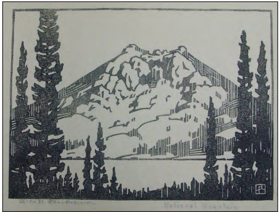
Medieval Mountain, VI , ca. 1916, woodcut on paper; edition No. 31, 5 1/8 x 7 inches. Bethany College Collection, Birger Sandzén Memorial Gallery