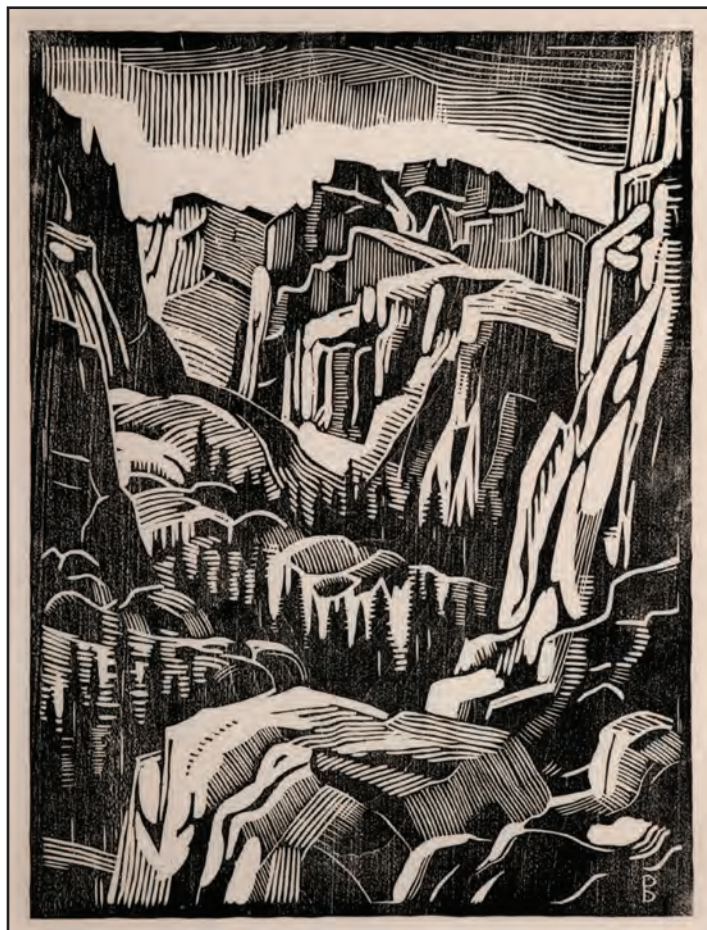
Untitled [aka The Gorge , or, Ramparts in the Rockies ], ca.1933, woodcut on paper, 10 x 7 ½ inches. Collection Kirkland Museum of Fine & Decorative Art, Denver, CO

In 1922, the Chappell House at 1300 Logan Street was given to the Denver Art Association to "provide a suitable place where artists may work and exhibit collectively." In the building there were twelve studios on the top floor, an extensive research library, and a gallery space on the ground floor. The next year, the Denver Art Association at Chappell House was officially established as the Denver Art Museum, which has been founded as an organization in 1893 and claimed office space in the Denver Public Library but had no true, physical home for a permanent