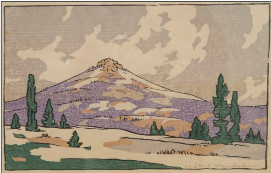
N.S. I [aka Estes Cone in Winter], ca.1912, color woodcut on paper; edition No. 2, 5 x 7 inches. The Wilson Family Collection

the artist. In the color woodblock XX, Babcock's design is a gemlike view of Mt. Russell, a "fourteener" in the Sierra Nevada mountain range in California. There are three impressions of the print in this exhibition from different collections—numbers 184, 196, and 200—all demonstrating a range of paper and ink color differences.