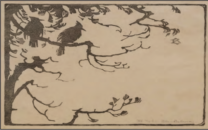
XV [aka Jays], woodcut on paper; edition No. 84. 4 ½ x 5 ½ inches. The Wilson Family Collection

(1878-1935). Babcock fell in love with the Rocky Mountains, eventually becoming a serious mountain climber, explorer, map maker, trail builder, along with being quite an artist.