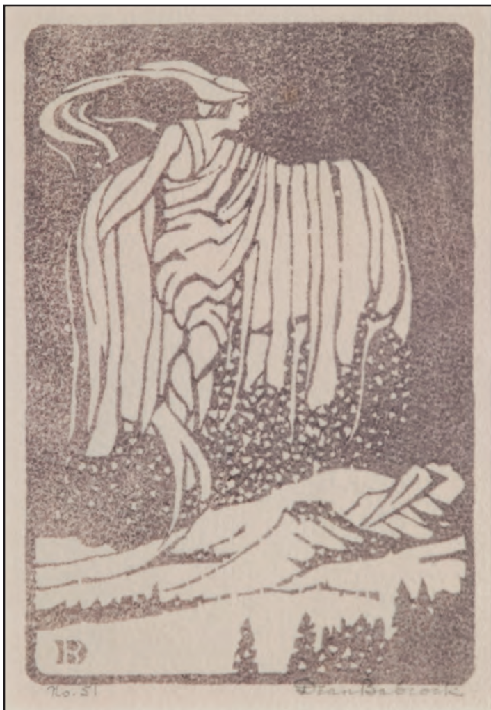
Untitled [aka Snow Fall or The First Snow ], woodcut on paper; edition No. 51, 4 x 2 5/8 inches. Collection Kirkland Museum of Fine & Decorative Art, Denver, CO

Japan. Dean Babcock's prints were praised as "faintly tinted, delicate and charming." 11