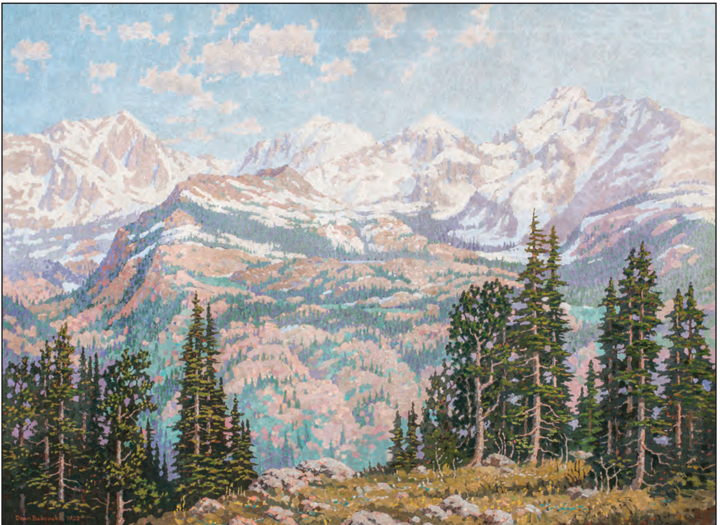
Wild Basin, Mt. Orton , 1922, oil on canvas Orton Memorial Library of Geology Art Collection, Ohio State University