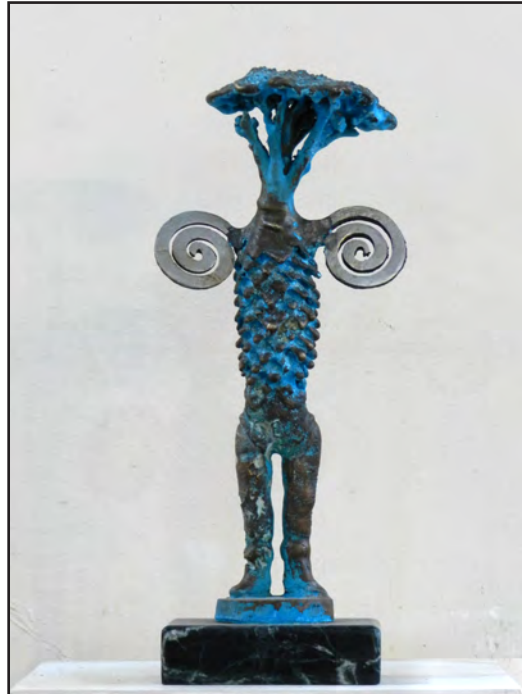
Broccoli Boy , 2016, cast bronze, stainless steel & verde antique, 13 x 5 x 3 inches