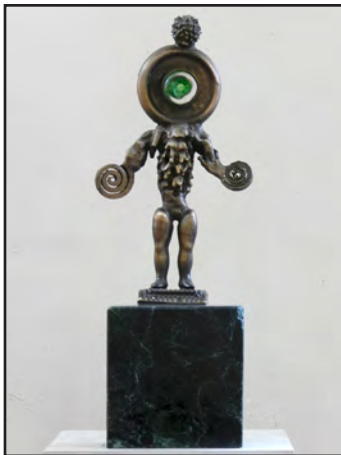
Odin , 2016, cast bronze, cast glass & verde antique, 18 x 6 x 3 inches