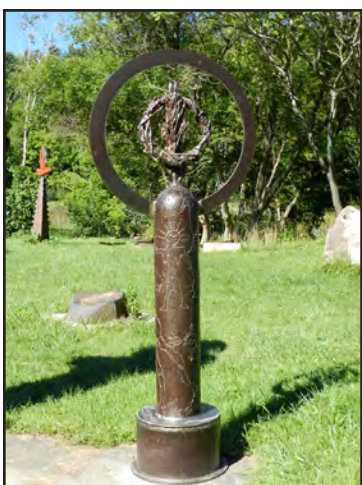
High Plains Stories Remembered , 2016, steel, stainless steel & ductile iron, 86 x 34 x 20 inches