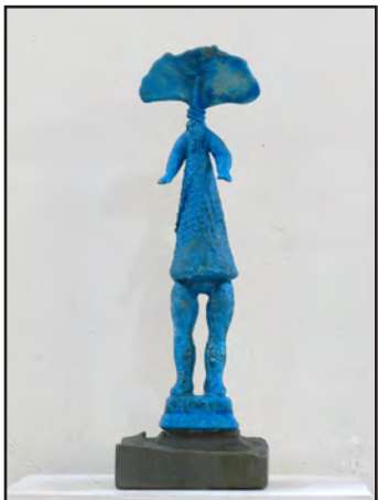
Ginko Girl , 2016, cast bronze & bluestone, 12 x 4 x 4 inches