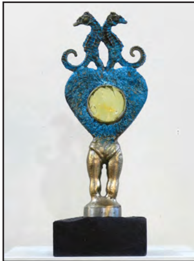
Lovers , 2016, cast bronze, cast glass & granite, 13 x 5 x 5 inches