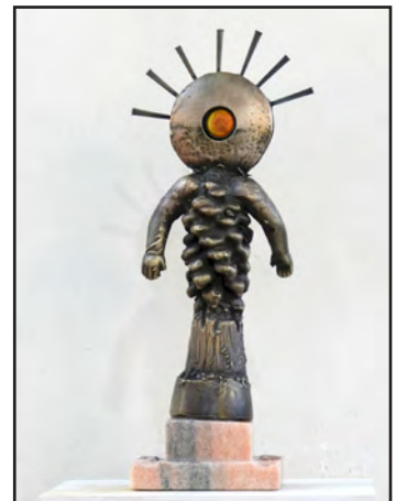
Sun Child , 2016, cast bronze, cast glass, steel & marble, 14 x 5 x 5 inches