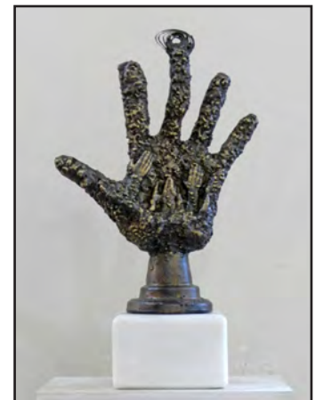
Fortunes Within , 2016, cast bronze, steel & marble, 15 x 8 x 4 inches