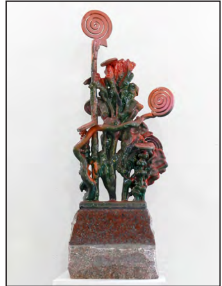
Viral Spiral , 2016, powder-coated cast ductile iron & granite, 26 x 11 x 7 inches