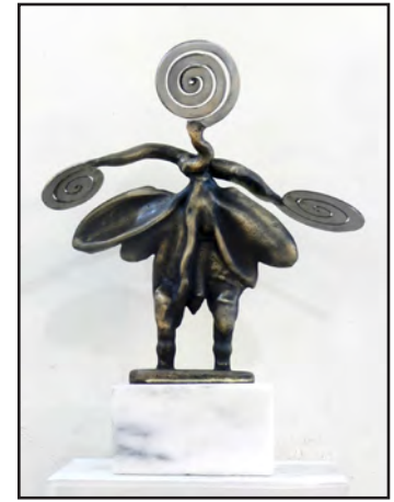
Moth Queen , 2015, cast bronze, stainless steel & marble, 15 x 12 x 4 inches