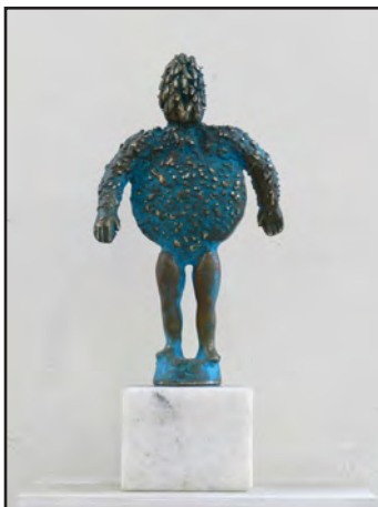
Swamp Walker , 2016, cast bronze & marble, 13 x 7 x 4 inches

This exhibition is generously underwritten by