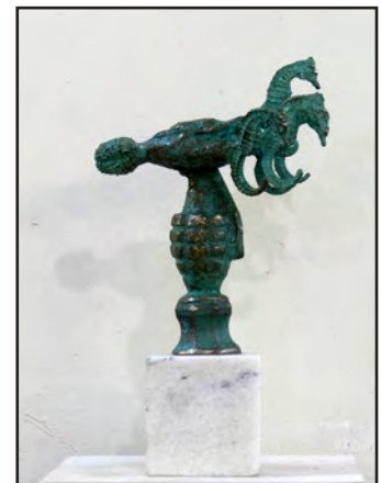
Horse Power , 2016, cast bronze & marble, 13 x 8 x 6 inches