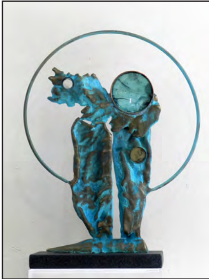
New Love , 2015, cast bronze, cast glass, brass & black granite, 19 x 15 x 7 inches