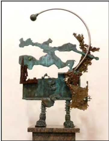
Early Alfred Man , 2003, porcelain-enameled steel, cast bronze, cast glass, cast steel & stainless steel, 37 x 20 x 14 inches