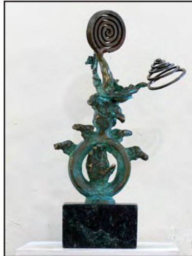
Save the Elephants , 2016, cast bronze, stainless steel, steel & verde antique, 15 x 9 x 4 inches