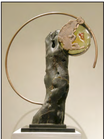
Chinese Autumn , 1991, cast bronze, cast glass & Chinese stone, 31 x 24 x 10 inches