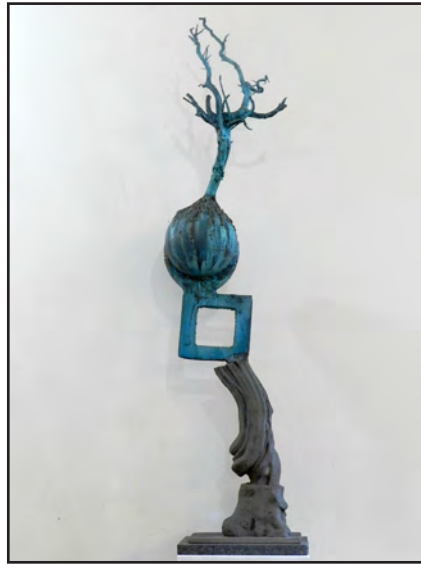
Homage to Growth , 2003, cast bronze, cast steel & stone, 43 x 12 x 9 inches