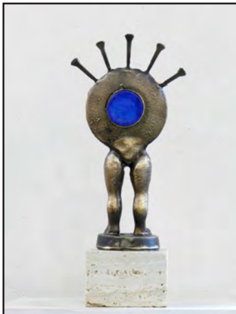
Blukachina , 2016, cast bronze, cast glass, steel & limestone, 11 x 5 x 3 inches