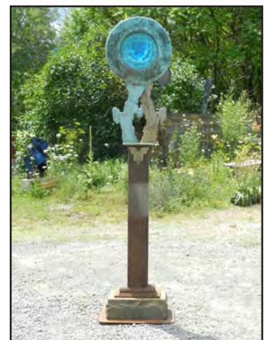
Lion Totem , 2015, steel, stainless steel, cast bronze, cast glass & bluestone, 89 x 23 x 16 inches