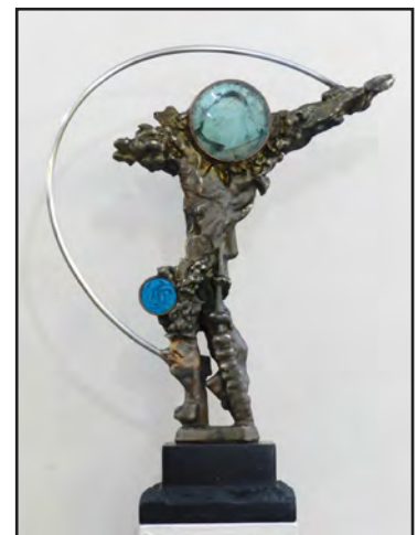
Cosmic Dancer , 2015, powder-coated cast bronze, cast glass, stainless steel & granite, 26 x 19 x 8 inches