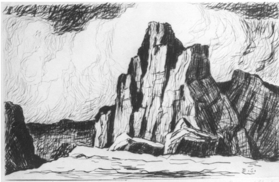
2 nd state