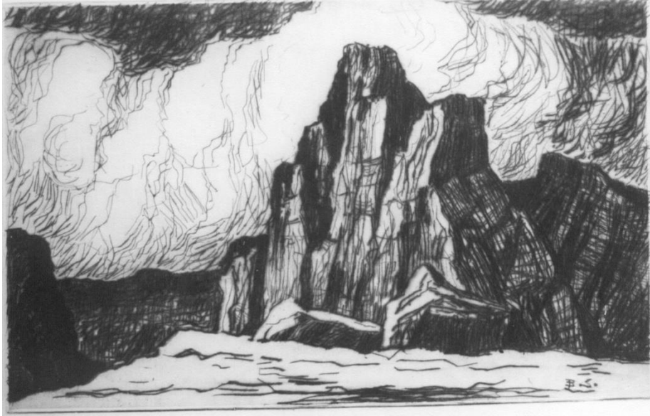
1 st state